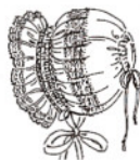
Classic View 1