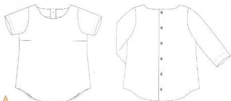
View A Shirrtail hem with short or \frac{3}{4} -length sleeves

a sewing pattern by rae hoekstra sizes XS - XXL