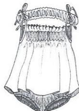
Romper with Float