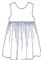
VIEW C FRONT