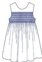
VIEW A & B FRONT