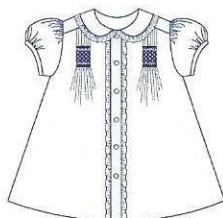
GATHERED TRIM FRONT

REQUIREMENTS: Fabric quantities allow for nap and optional self ruffle trim.