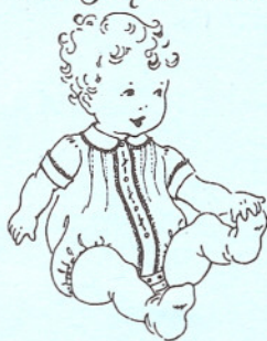
Baby Boy Romper