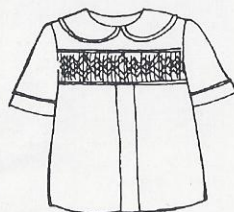
Boy's Short Sleeve Shirt