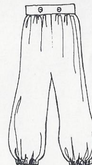
Girl's Long Pants (Unlined)