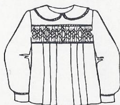
Boy's Long Sleeve Shirt