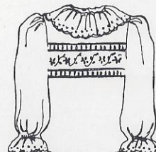
Girl's Long Sleeve Blouse