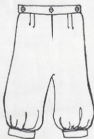
Boy's Knickers (Unlined)