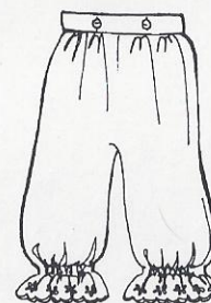
Girl's Knickers (Unlined)