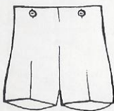
Boy's Short Pants Lined