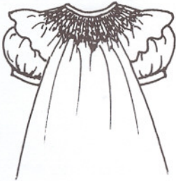
Angel / Short or Long Sleeve (4)