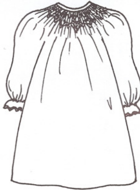
Long Sleeve (2)