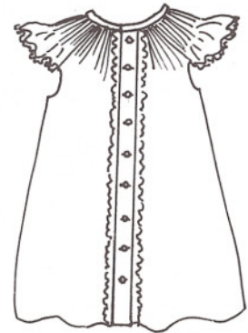
Angel Sleeve (3) (With or without wide Placket)