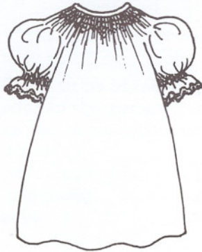
Short Sleeve (1) (Pictured on Cover)