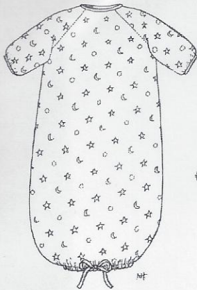
Baby Sacque Ideal for Soft Knits