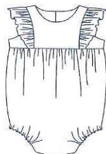
VIEW A FRONT