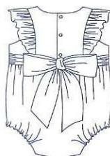
VIEW A & B BACK